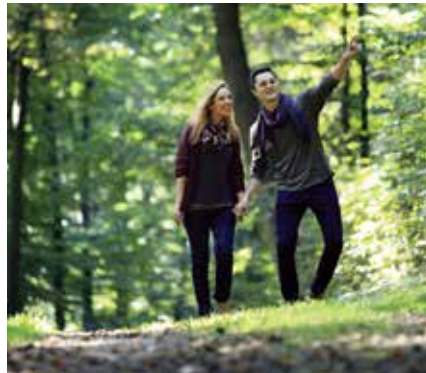
Heywood's new walking path, wellness programs, flu clinics, support groups and school nutrition programs are a few examples of ways we help make our region a healthier place to live.

Hospital and development of The Quabbin Retreat, a substance abuse and mental health treatment facility in Petersham, MA