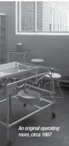
An original operating room, circa 1907