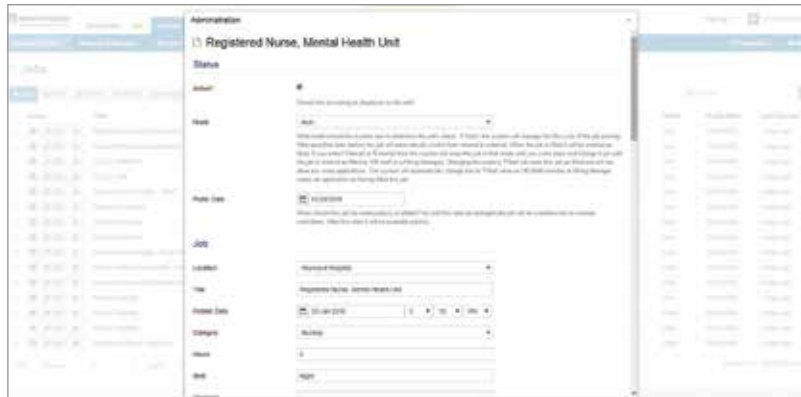
The Heywood Healthcare job portal.

Though the idea of LEAN thinking has its origins in the automobile industry in the early 1990s, its principles have been adapted beyond manufacturing, distribution, retail, construction, maintenance, government, and of course, healthcare. Today, the state of healthcare is more regulated than ever, resulting in a direct effect on reimbursement for services rendered. Heywood Healthcare Leadership recognizes the need to make strategic improvements in all areas to ultimately remain financially viable. Providing quality healthcare at the bedside is not enough to sustain a healthcare organization in today's market. Heywood Healthcare strives to continuously improve processes across all service lines, working toward our goal: to be one of the best independent community hospitals in America.